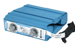
Wedge kit e Wedge Roxtec